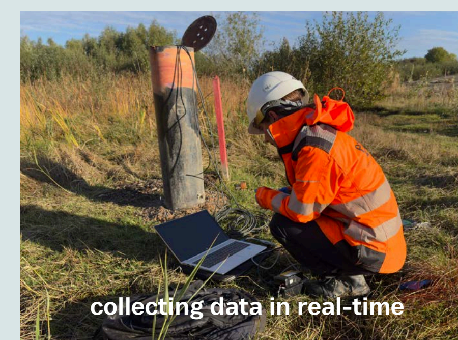
collecting data in real-time